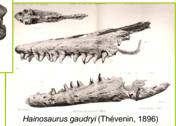
Hainosaurus gaudryi (Thévenin, 1896)